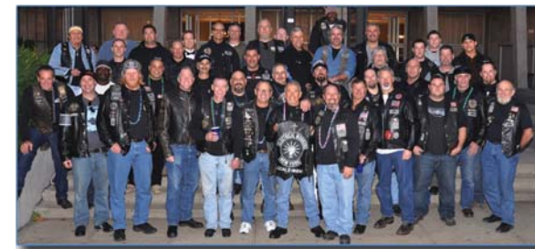
IBEW Local #3 Motorcycle Club

On Oct. 22nd , the International Brotherhood of Electrical Workers Local Union #3 hosted the Harvest Ball for 500 individuals with developmental disabilities and their families. What a night! Our thanks to a great group of guys.