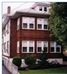
Staten Island Residence

If he's right and state funds continue to shrink then the future of the aging population will depend more and more on Direct Care Professionals.