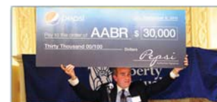
PEPSI CO. Presents check for $30,000

On Oct. 22nd , the International Brotherhood of Electrical Workers Local Union #3 hosted the Harvest Ball for 500 individuals with developmental disabilities and their families. What a night! Our thanks to a great group of guys.